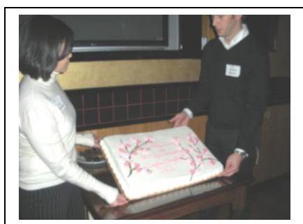
A cake to celebrate Dayton JACL's 60 th anniversary